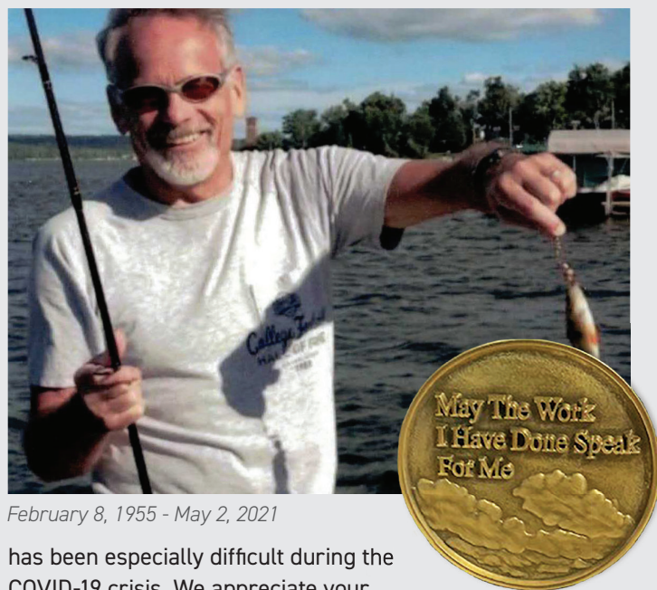
February 8, 1955 - May 2, 2021

Many thanks to volunteers that gave their time to contribute to the many moving parts within the Home. This past year